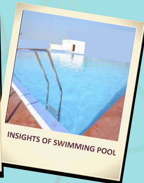
INSIGHTS OF SWIMMING POOL