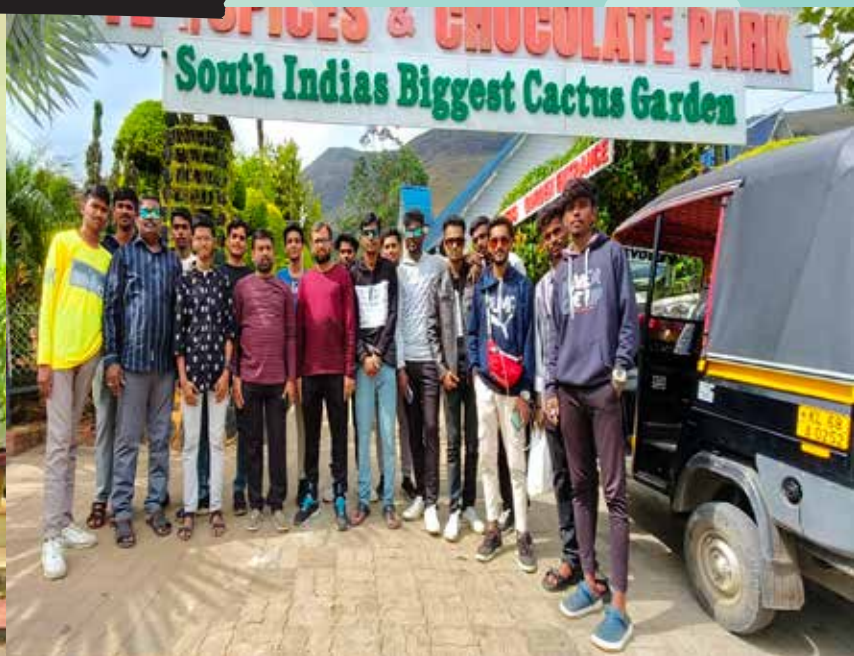
The Staff and Students of the Department of Biochemistry went on Central Marine Fisheries Research Institute and South India's Biggest Cactus Garden, Kerala on 24-01-2025