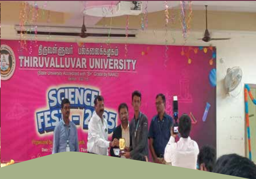
A total of 13 students from our college participated in the Thiruvalluvar University Science Fest 2025, and two of them bagged the first prize, along with four faculty members on 24-01-2025.